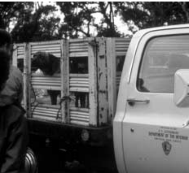
Using hunting dogs in alien pig removal project in Hawai'i Volcanoes NP (USA). Areas are then fenced against re-invasion.