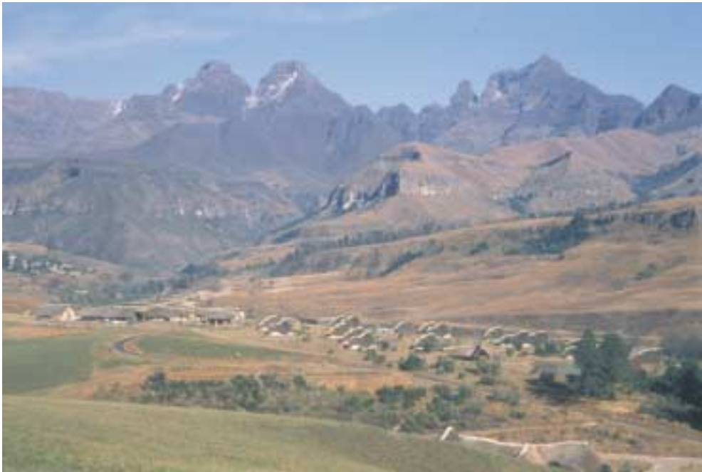
South Africa's uKhahlamba-Drakensberg World Heritage Site, showing Didima Camp where workshop was held.