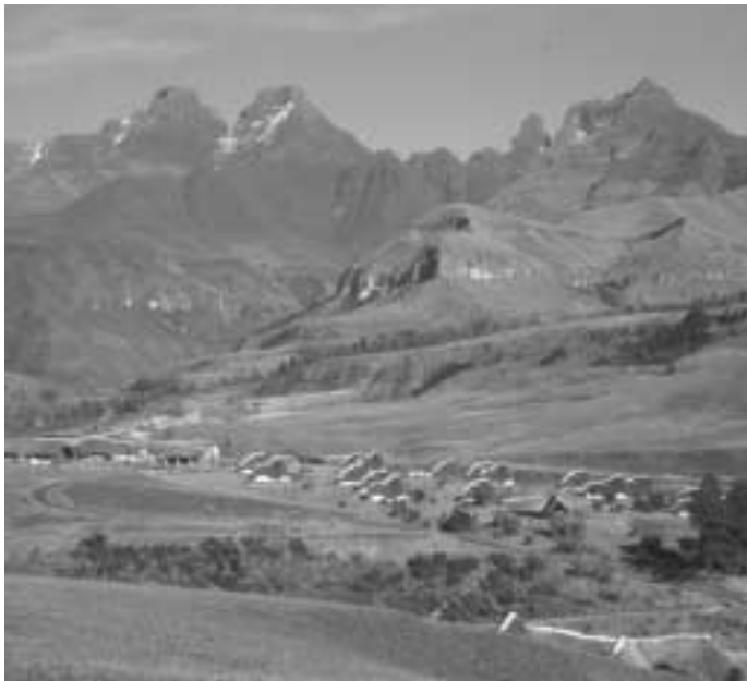
South Africa's uKhahlamba-Drakensberg World Heritage Site, showing Didima Camp where workshop was held.