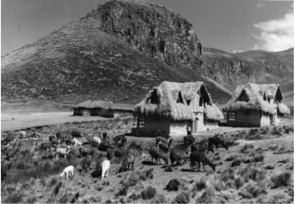
Privately operated ecotourism facility (“Adventure and Culture”) in indigenous style, plus llamas, in peripheral zone to Chimborazo PA in Ecuador.

residents, local communities and indigenous people. Including feedback from visitors about public safety provisions will help managers discover new ways to enhance their enjoyment of the mountains.