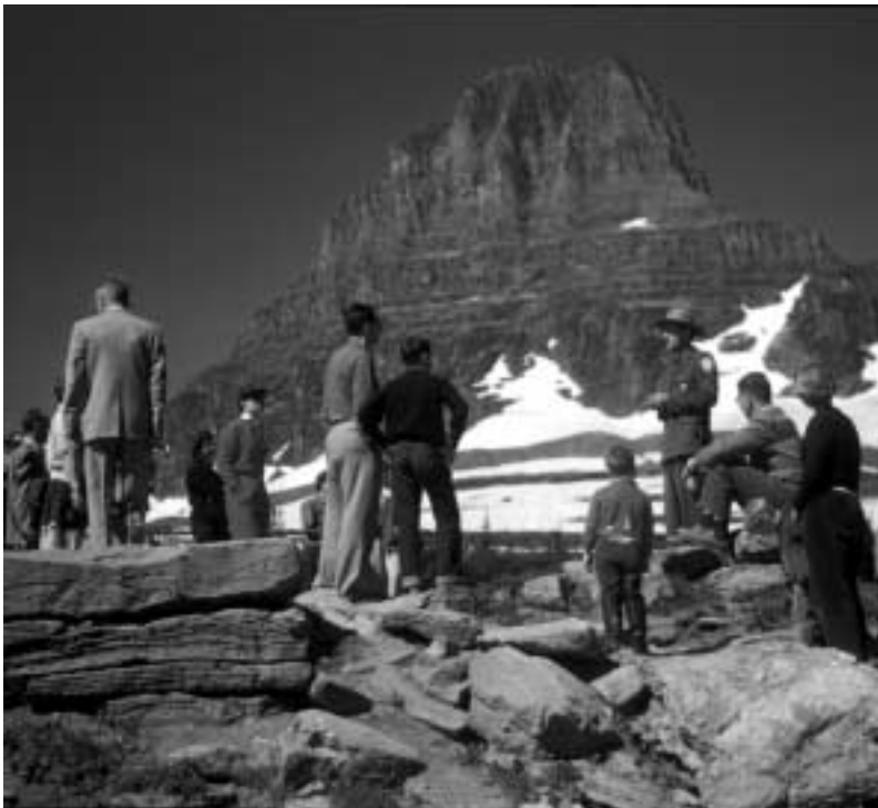
Educational guided walk for visitors to Glacier NP (USA) by Interpretive Naturalist.

Good education and interpretation require specialist skills, should be based on solid evidence and research and should engage the minds and spirits of the audience. Education and interpretation should be socially equitable in its content and delivery.