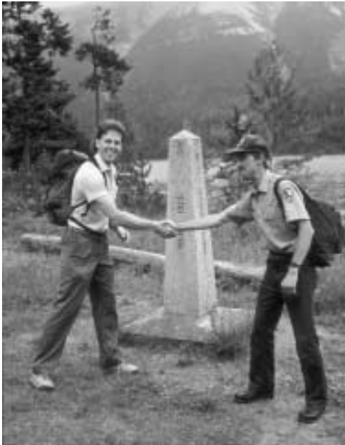
Hands across the border of Waterton Lakes/ Glacier International Peace Park, established in 1932 between Canada and USA.