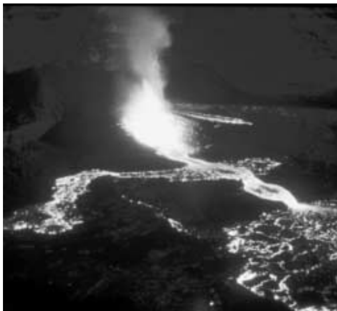
Periodic and well-monitored volcanic eruptions characterise Hawai'i Volcanoes National Park, Biosphere Reserve and World Heritage Site. The volcano is the current abode of the Hawaiian goddess Pele.