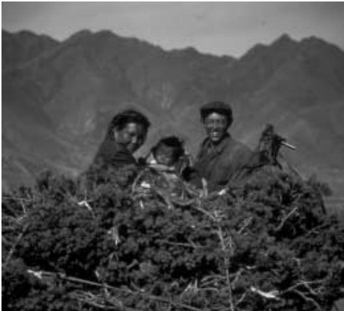
Mountain people have a pride and love for their mountains, and can be valuable allies in supporting mountain protected areas.

Very few, if any, of these communities are not influenced to some extent by the world outside and this influence is bound to increase, through improved access and communications, health care, education, new technology, visitors from outside and the return of local people who have seen other places. “Change” is the order of the day. Improved communications, which are an inevitable result of development, can in time lead to out-migration (especially of the young) and a breakdown of the social fabric. Mountain protected areas can provide a legal and administrative framework within which communities may develop in an appropriate and controlled manner, while maintaining essential elements of their special cultures.