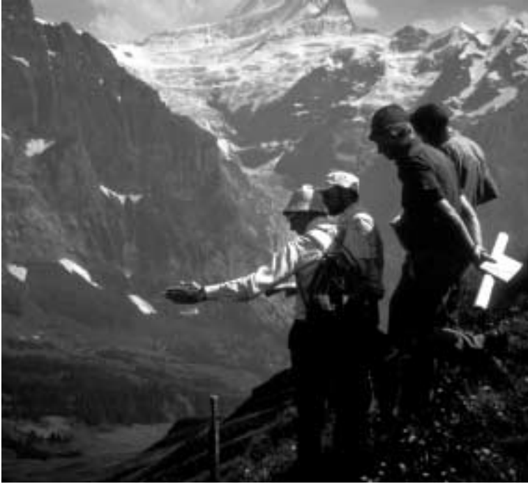
Monitoring glacial retreat in European Alps.