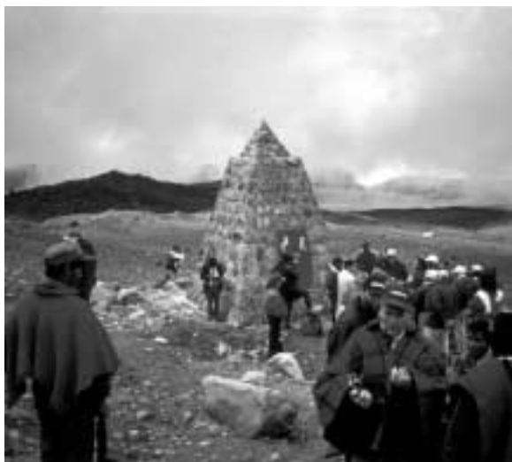
Local community members and politicians join with scientists and management staff to dedicate a plaque to Alejandro von Humboldt as the father of mountain ecology. On the upper flank of Chimborazo (Ecuador), at a Simón Bolívar monument, the plaque message is written in the indigenous Quechua language as well as Spanish and English.