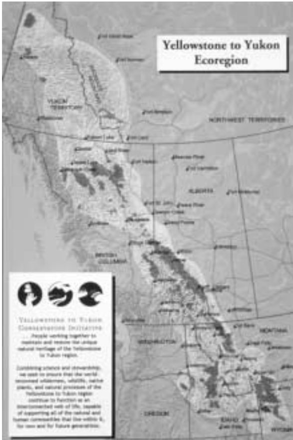
The Yellowstone-to-Yukon Initiative is attempting to connect PAs along the Rocky Mountains in a Conservation Corridor of some 3200 kilometres. Illustration: The Y-2-Y Coalition

connectivity with other PAs or areas of natural habitats. Regulating land or water use or promoting land stewardship in the areas between reserves can supplement the conservation estate and maintain natural corridors.