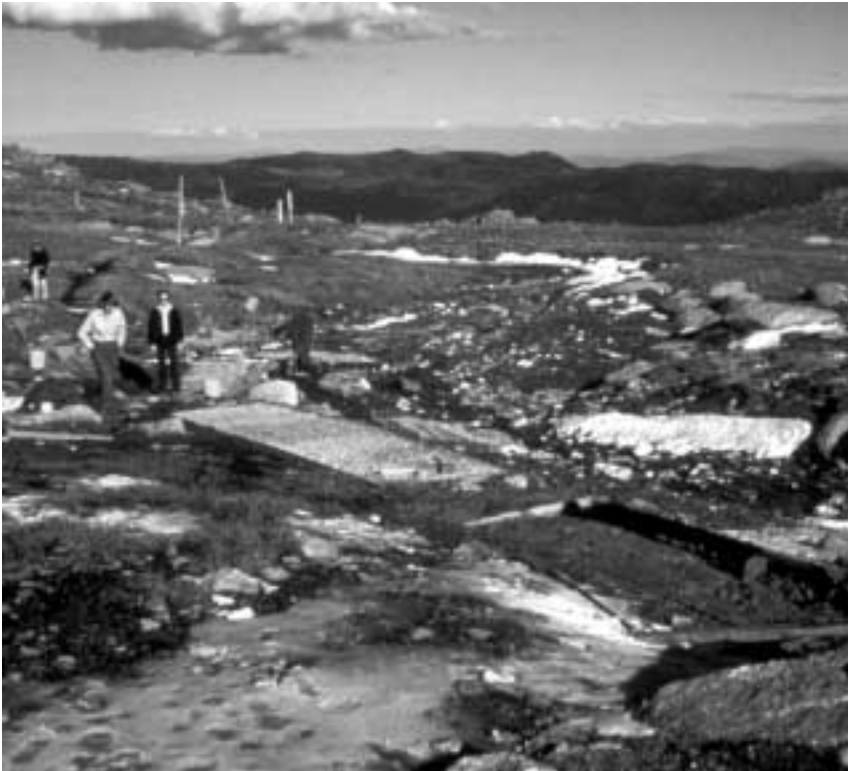
Damaged alpine area being restored in Australian Alps NPs.