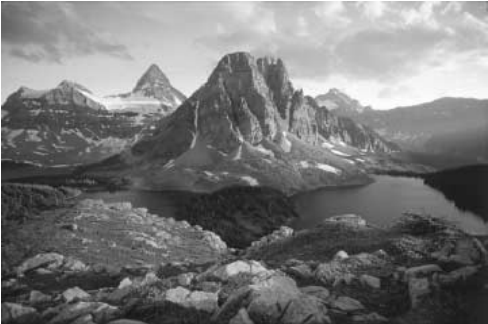
A wilderness area surrounds Mount Assiniboine on the border between Banff NP and Mt. Assiniboine Provincial Park, included in the Canadian Rocky Mountain Parks World Heritage Site.

Remember that IUCN and especially its World Commission on Protected Areas, is a source of advice and assistance. The fine IUCN/Cardiff University Best Practice Protected Area Guidelines Series will prove useful to planners and managers of MtPAs. They cover such topics as: national system planning, economic values, financing PAs, evaluating effectiveness of management, indigenous and traditional people, as well as the aforementioned transboundary PAs. Where the MtPAs contain caves or karst, a guidelines manual somewhat akin to this one, is available. Consult IUCN Publications Services Unit info@books.iucn.org or www.iucn.org/bookstore/pro-areas-5.htm#B326