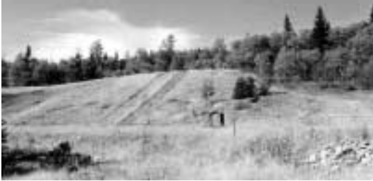
Snowmobile-caused erosion in Waterton Lakes NP (Canada) due to insufficient snow cover. Are snowmobiles appropriate in Category III National Parks?