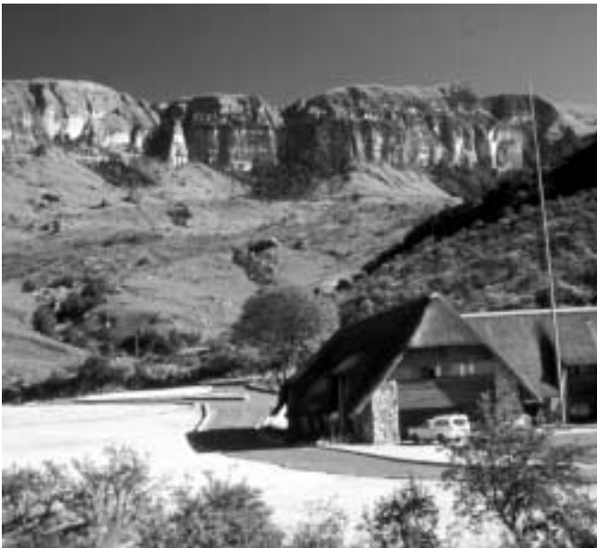
A well-designed entrance and visitor information centre at Royal Natal NP, South Africa.