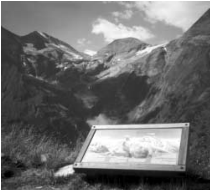
Sturdy, informative panel explaining glacial phenomena at Hohe Tauern NP (Austria).