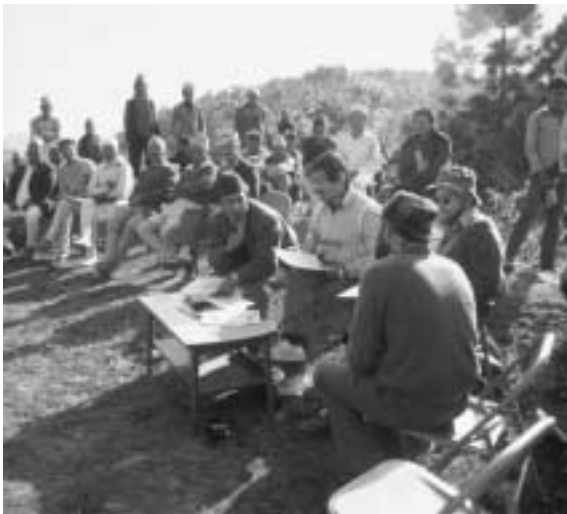
A community consultation in Nepal to solicit input on proposed new management procedures.

Mountain protected areas which contain people may aim to protect not only natural features but also the essential elements of the cultural landscape, archaeological and historical monuments and vernacular buildings. They should provide a framework in which this can be done by encouraging sympathetic economic development which preserves the cultural identity of the resident communities who live in or near the protected area. Although the overriding goal for mountain protected areas should be biodiversity, water conservation and the maintenance of landscapes and wild lands, an essential and integral part of this goal must be recognition that the knowledge, rights, lifestyles and cultural values of people living in and near mountain protected areas, including identity grounded in places, must be integral to the goals of mountain protected areas.