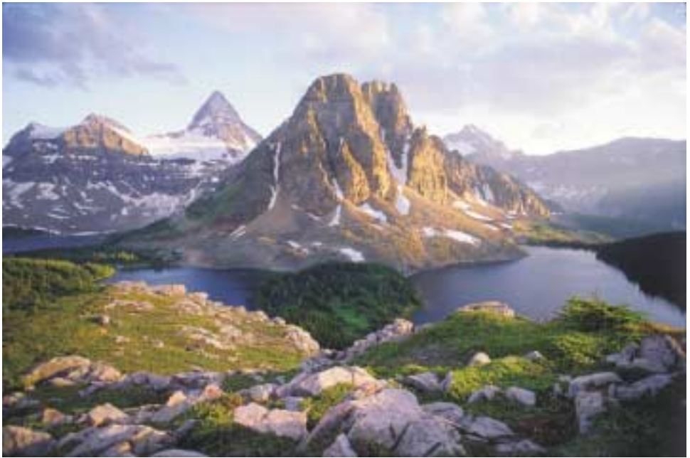
A wilderness area surrounds Mount Assiniboine on the border between Banff NP and Mt. Assiniboine Provincial Park, included in the Canadian Rocky Mountain Parks World Heritage Site.