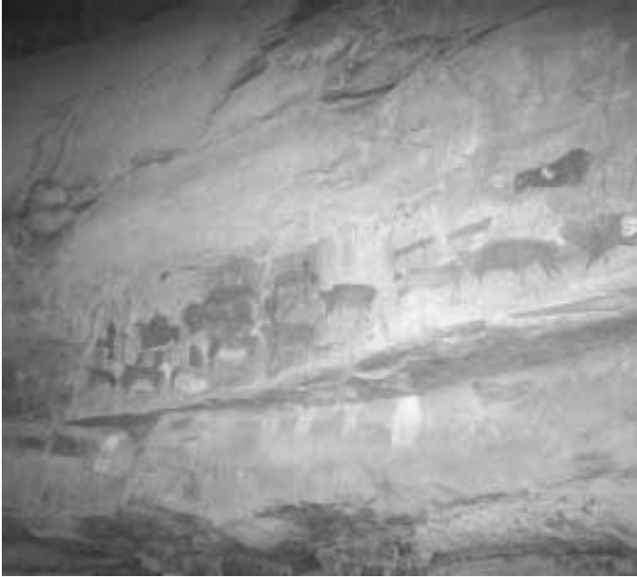
Elements of the San culture are revealed in secretive cave shelters in the Drakensbergs (South Africa), and must be carefully and sensitively interpreted to visitors.

The interpretation of sacred sites must be done with particular sensitivity. For many of the world's people, religions are based on nature gods and goddesses that provide an overriding system of order – a cosmos – which includes all environments from mountains to the seas; “spirituality” is considered to be inherent in all natural things. Such a comprehensive approach to sacred values may provide a broad framework for giving special protection to very many specific elements of the MtPA.