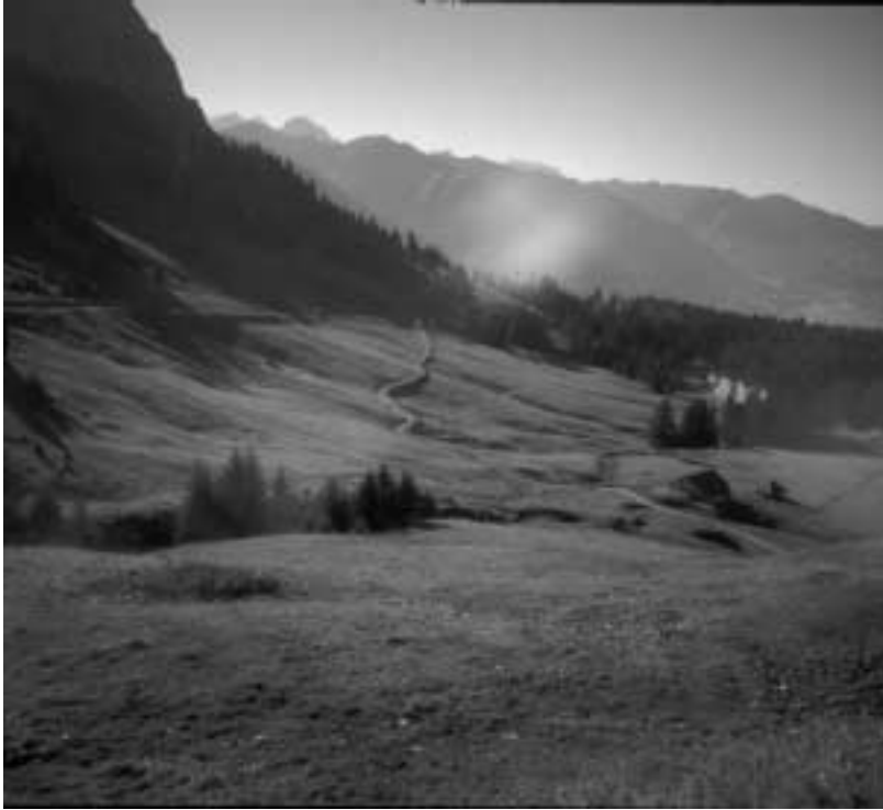
Entlebuch Biosphere Reserve in Switzerland is a Category V Protected Landscape.

little-disturbed natural ecosystems of mountains offer unique opportunities for benchmark research and monitoring as global change occurs. But the whole concept of protected areas, applied flexibly, does provide for graded degrees or zones of protection within the chosen area which will enable development to take place in a controllable way and at a controllable rate, to the greatest possible advantage of both local communities and the environment. Indeed there would be merit in extending the general principles to policies affecting all mountain regions, whether formally protected or not.