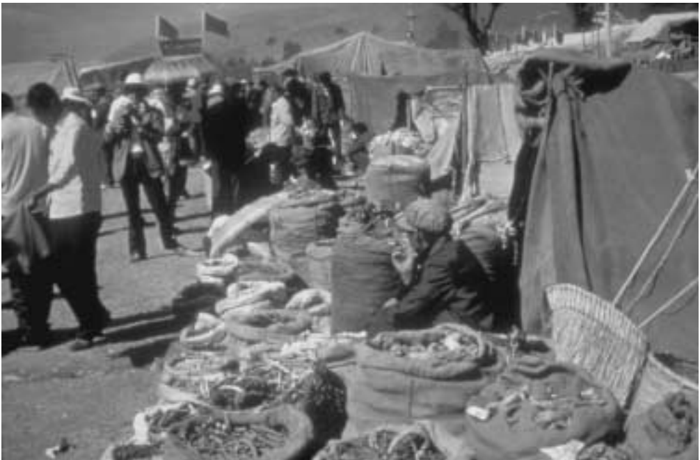
Market at Dali, Yunnan, China where mountain tribal peoples brought 550 different species of plant and animal products harvested from the mountains.

The preservation of the full range of biodiversity and of physical features is an essential element in the selection of mountain protected areas. As an integral part of planning, provision should be made for the protection of large examples of natural ecosystems and of populations of plant and animal species, together with sites illustrating the principal geological and physiographic features and the processes at work in the landscape. These should be supplemented by the protection of a larger number of small areas representing the full local variety of species and ecosystems, including intra-specific genotypic variation.