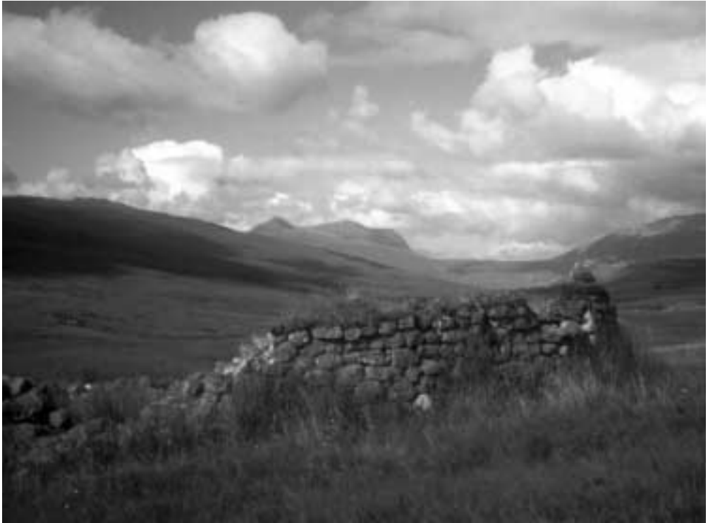
Though the tallest mountain – Ben Nevis – is 1,343 metres, these Scottish highlands are beloved and respected by Scots mountaineers.

Becoming widely accepted, and used by the United Nations Environment Programme-World Conservation Monitoring Centre (UNEP-WCMC), is a system devised by Kapos et al. in 2000. 1 For our general purposes, let us label as mountains or highlands, those steep-sided, three-dimensional earth features that are conspicuous in the landscape, have more than one altitudinal vegetation zone, and are regarded as mountains by local people.