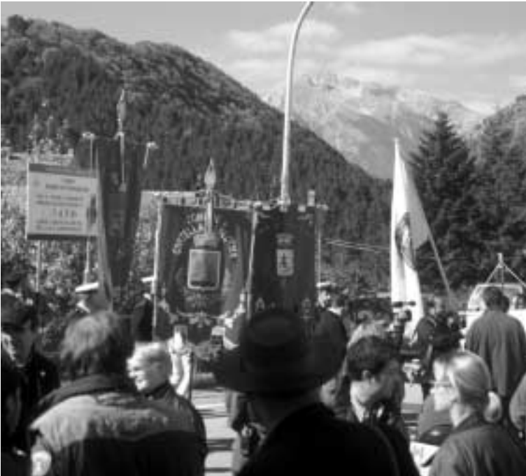
A cultural community festival, sponsored by Abruzzo NP (Italy).