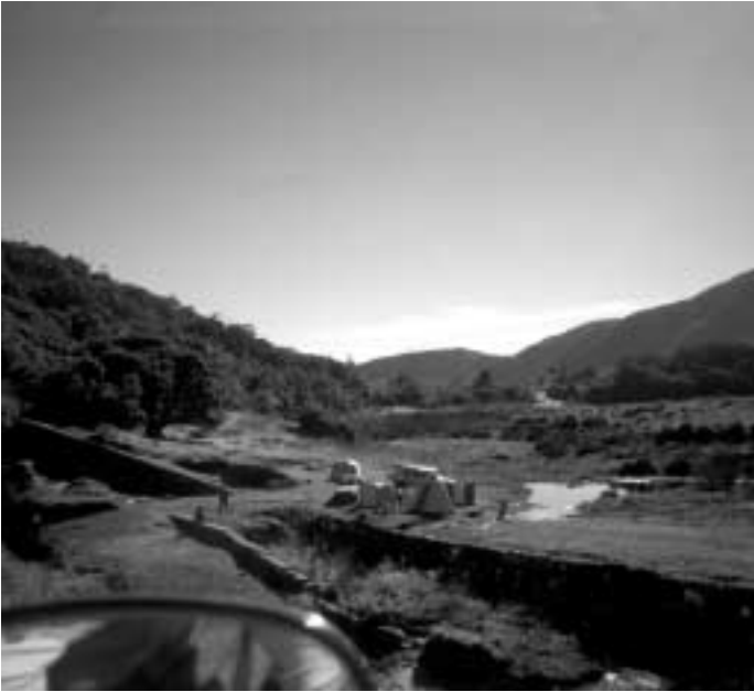
Camping sites at upper elevations need to be carefully sited and regulated, as here in Brazil’s Itatiaia NP.

mountaineers and boulderers. However, these groups often have strong traditional “leave no trace” ethics, so can be engaged proactively and positively by land managers to be in effect “self-managed”. In cases where such groups have formally established ‘protocols’, guidelines or internal regulation, it may be expedient for the management plan to simply recognise and manage to these protocols for all practitioners of the particular activity, whether members of the body or not.