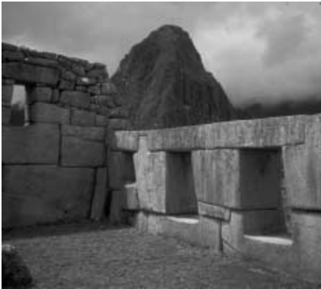
The Historic Sanctuary of Machu Picchu (Peru) was built amid spectacular mountains by the Incas, and is both a Natural and a Cultural World Heritage Site.